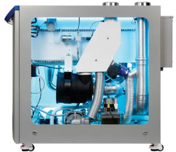
EnerTwin micro-CHP system

The recuperator is an advanced heat exchanger recovering exhaust heat into the gas turbine working cycle, saving almost 50% of fuel compared to a system without a recuperator and providing a substantial increase in efficiency.